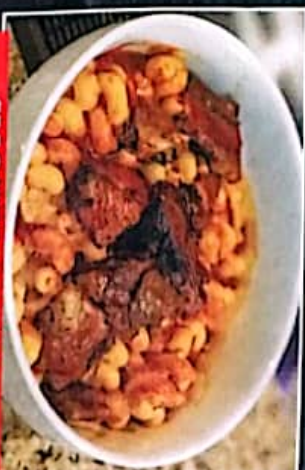
SMOKED BRISKET MAC N CHEESE