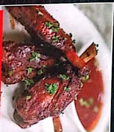
SMOKED PORK SHANKS